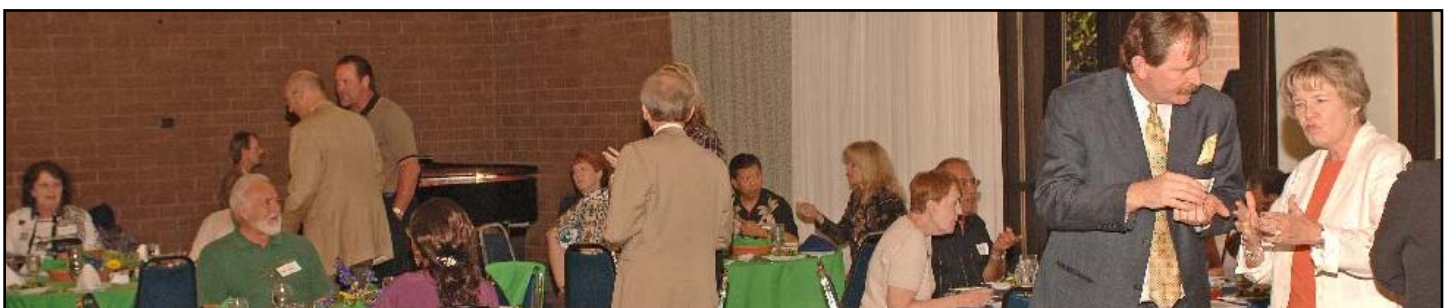
Pre-ceremony activity at the luncheon